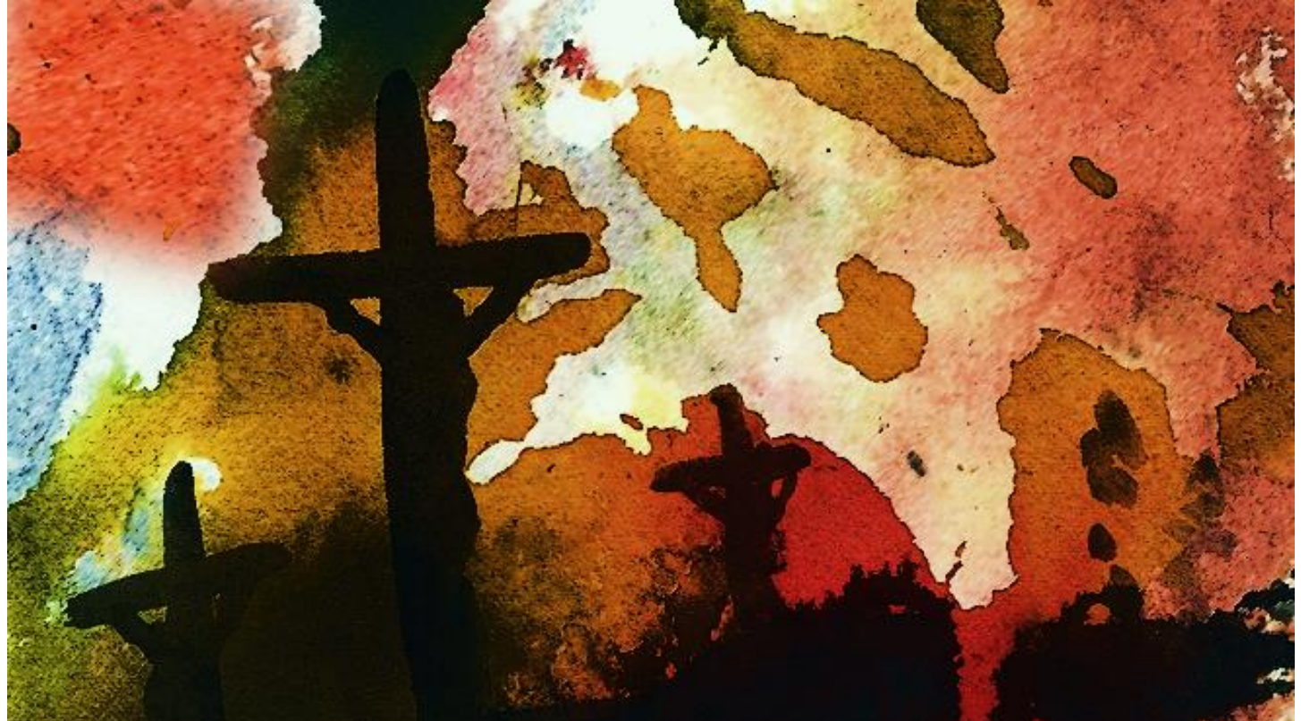
In fulfillment of many Old Testament prophecies Jesus was betrayed, brutalized, mocked, and murdered.

No middle ground remained and for the wealthy elites, in love with their status and position, it was a foregone conclusion as to what they would choose.