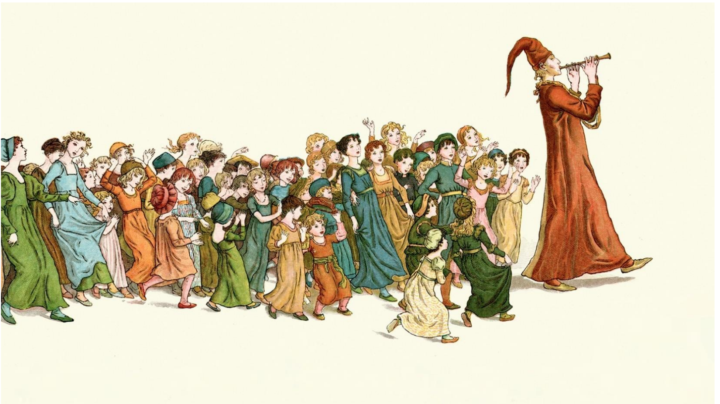
Figure out which one you are, and be that person. Choose your path. Once you wisely choose the hard road with the narrow gate, you will find that there are many obstacles along that path that must be overcome.

One of the biggest, most common, most warned about and yet, most successful, obstacles of all, is false influence peddled by false influencers. These people work to influence you with what will hinder your progress on the already difficult path and their activity will threaten to derail you from it entirely.