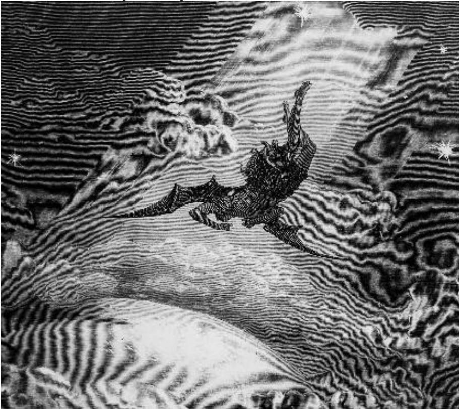
Satan Cast Down to Earth

From our perspective, it is little more than a constant parade of choices where we use our God given free will, countless times a day. For God, "It is finished." It's all about perspective.